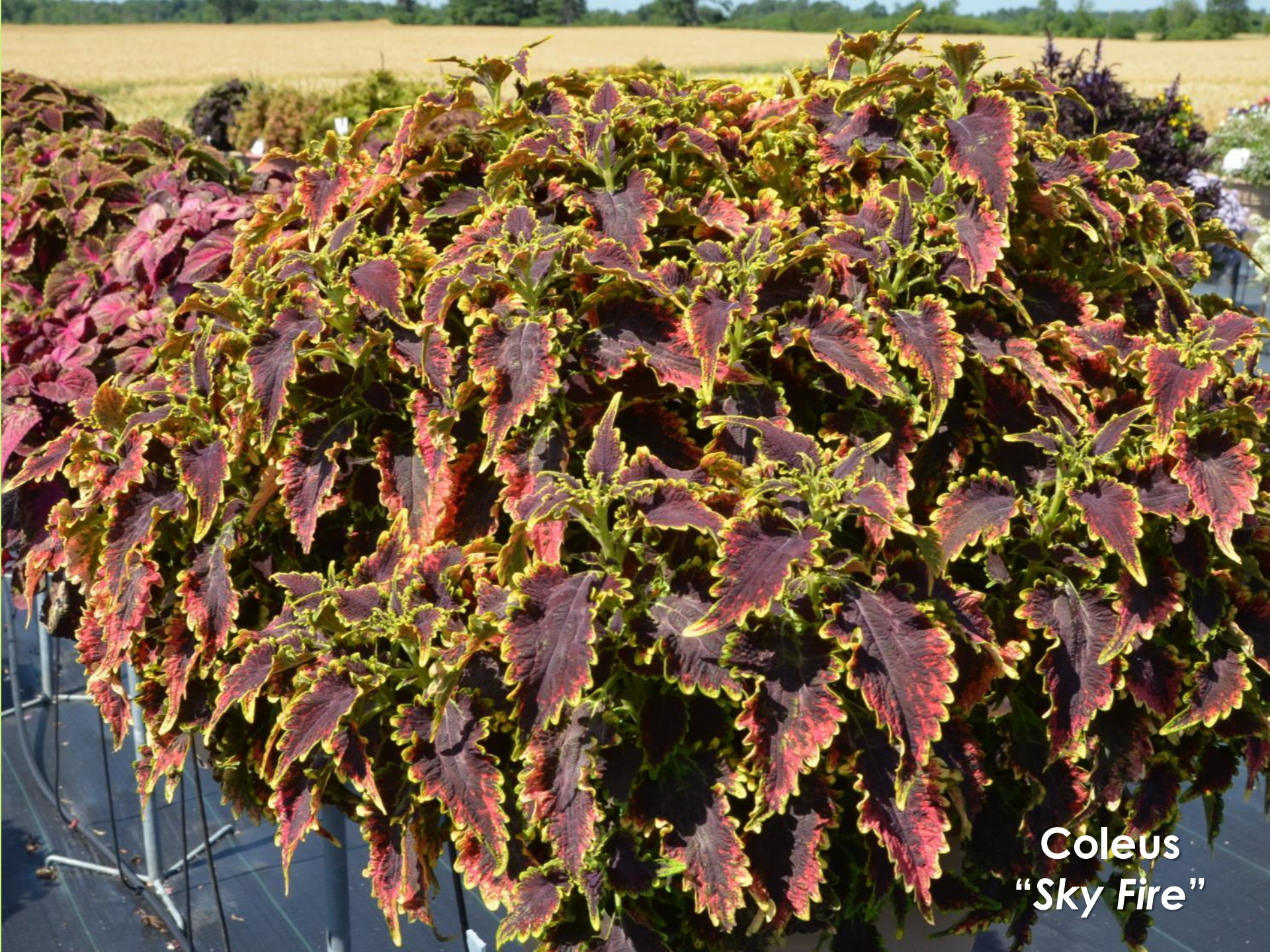
Coleus "Sky Fire"