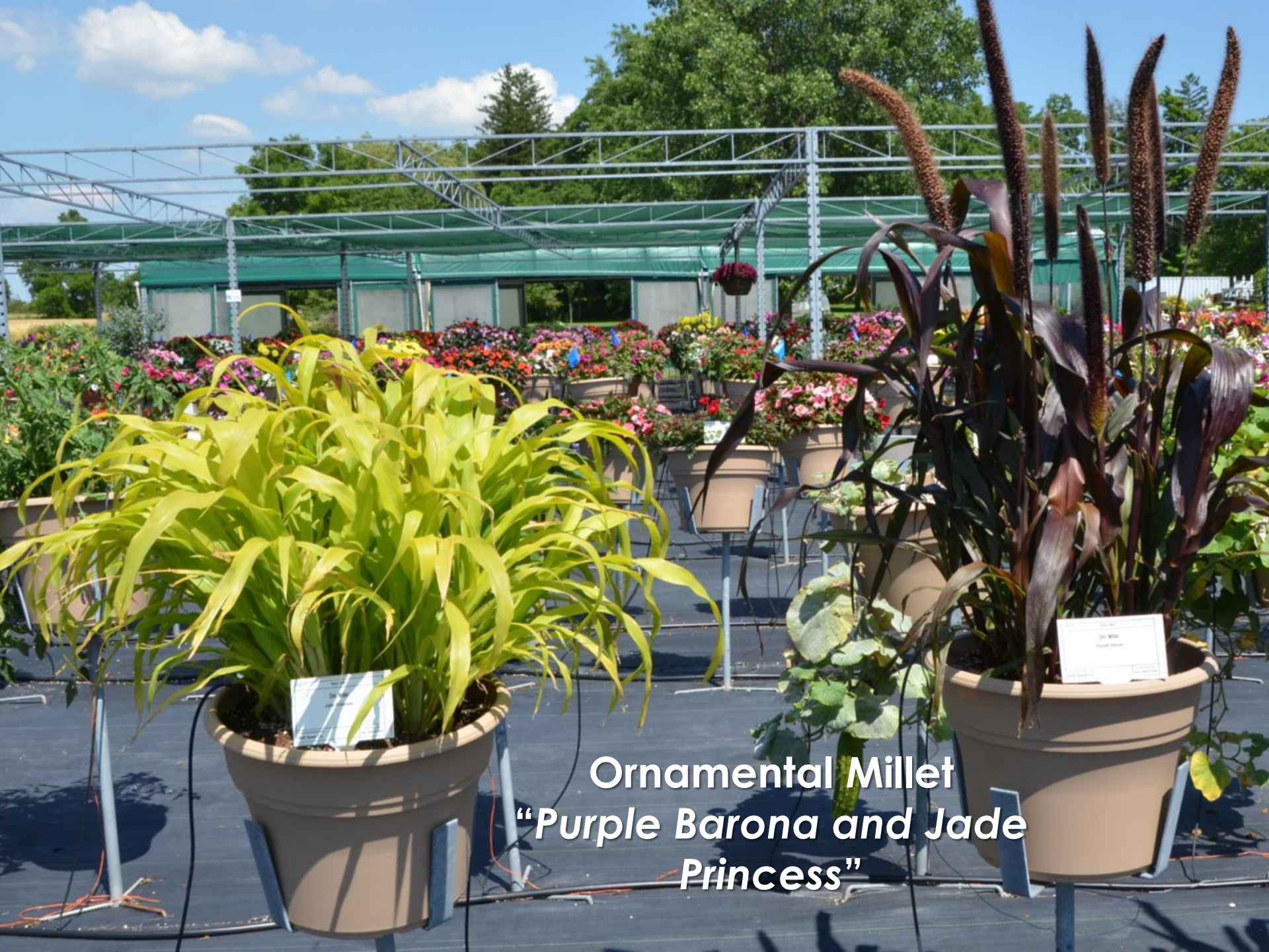
Ornamental Millet "Purple Barona and Jade Princess"